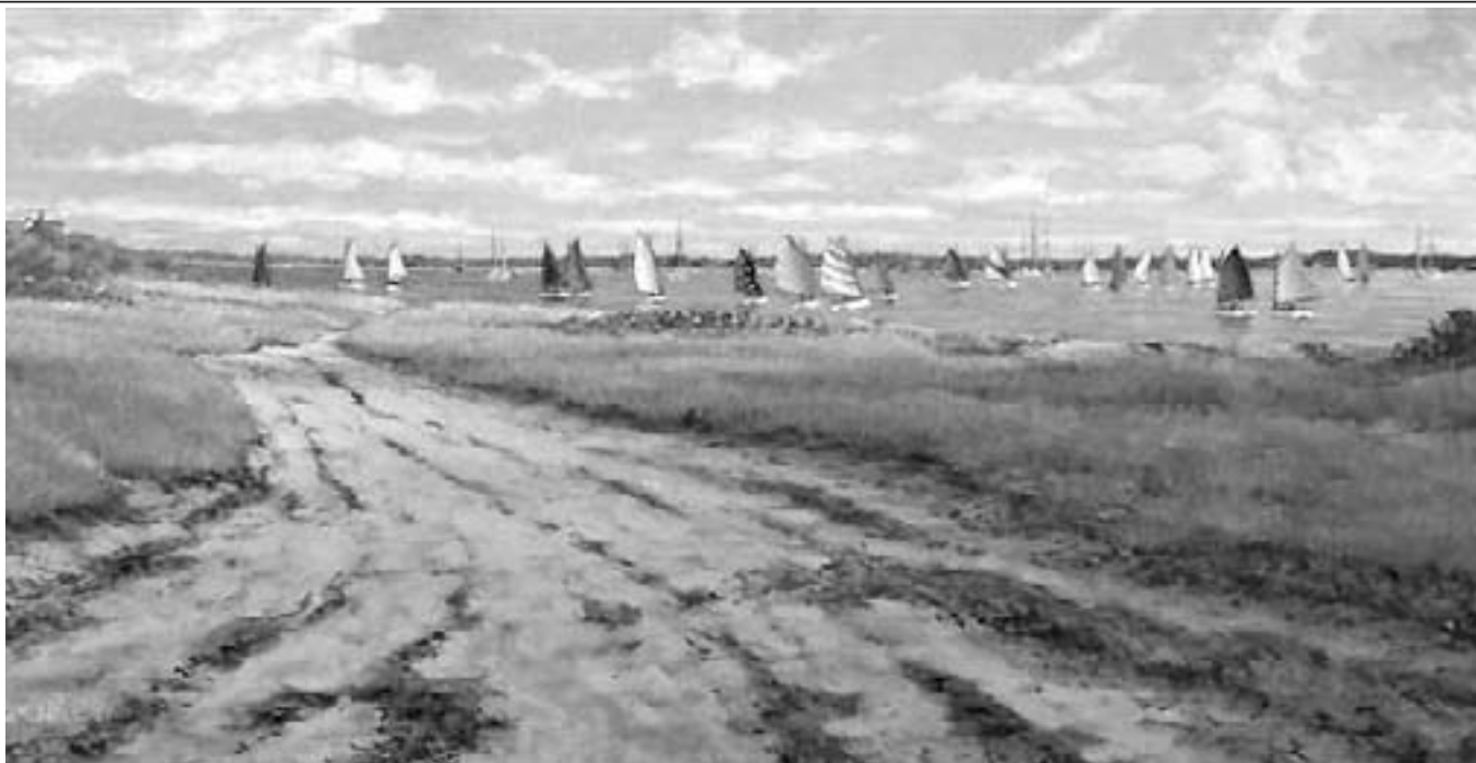
18" x 36"