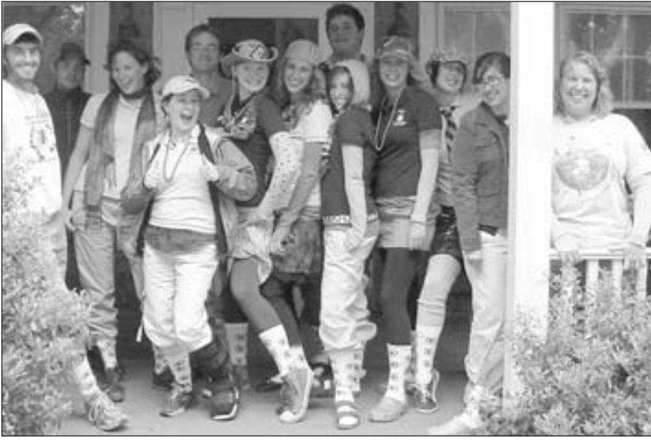
A group of the interns at Maria Mitchell this summer.