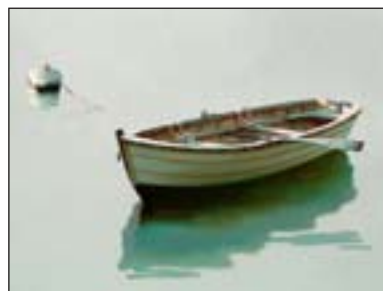
ZHEN-HUAN LU, "LONELY BOAT," OIL, 24" x 30"

Established in 1968, Pierce Galleries, Inc. specializes in 19th-21st century American and European paintings, fine antiques and jewelry and art history.