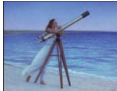
PETER QUIDLEY, "STARS"

Exhibiting marine, landscape, figurative and still life artworks.