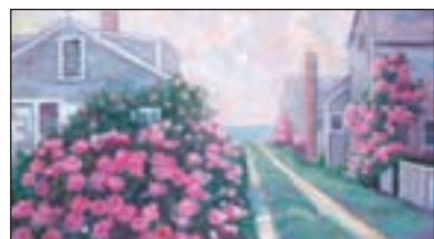
"SCONSET MIST ROSES"