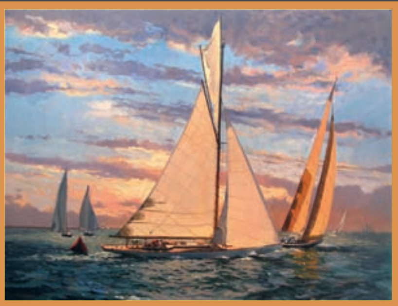
Nantucket Race Day, 2007 oil on linen 30 x 40 in.

The Brigham Galleries is excited to present a preview into the "Realism, Impressionism, & Abstraction" show we will be having this summer!